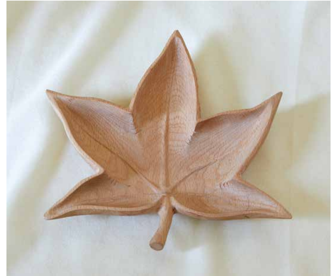
SUGAR GUM LEAF WOOD BOWL