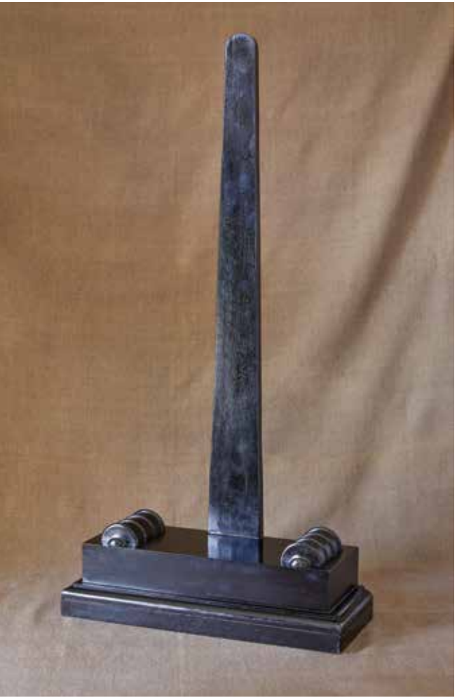
LARGE ARTWORK EASEL