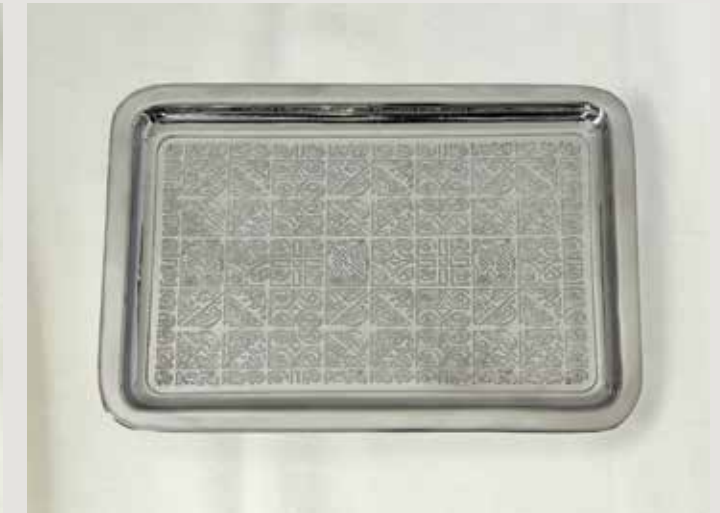
OCEANE LARGE NICKEL-PLATED BRASS, 11"L x 7.75"W x 0.375"H (TY01-OCE)