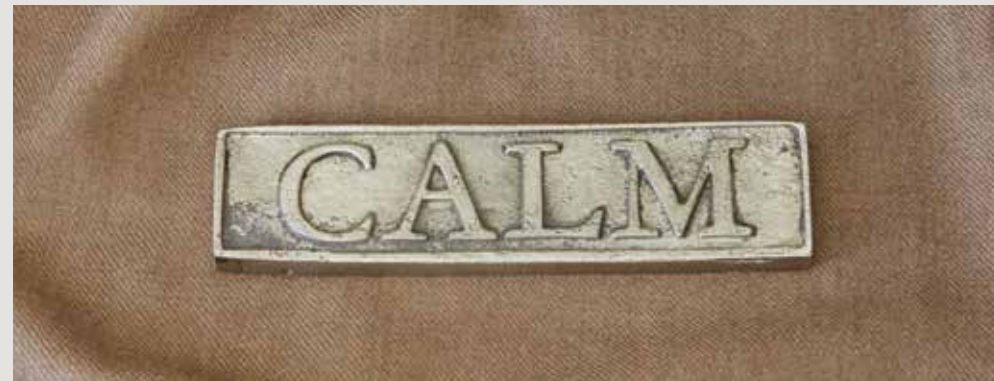
CALM NICKEL-PLATED CAST IRON, 7.5"L x 2"W x 0.5"H (PW01-NKL)