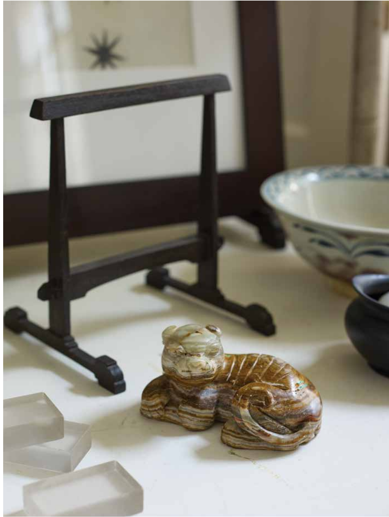
The easels are photographed on a vintage table in the library corner of our Academy house living room. Also from the collection, the Zi dragon in striped onyx is one of our special map weights. Its name means "graceful."