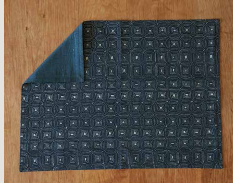
KAI PLACEMAT 100% COTTON, 19"L x 14"W, SET/4 INDIGO (PM01-IND)