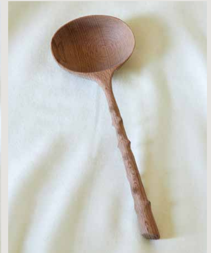
LADLE BEECHWOOD, 12.375"L x 4.375"W x 1.875"H (WS02-BCH)