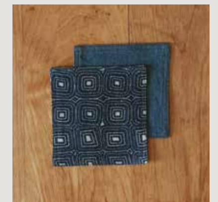
KAI COASTERS 100% COTTON, 4"SQ, SET/4 INDIGO (CO01-IND)