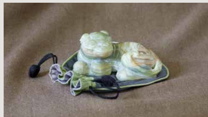
ZI "GRACEFUL" DRAGON EMERALD GREEN ONYX, 4.75"L x 3"W x 2.25"H (SO04-ONX) — Presented in a unique silk pouch; colors may vary.