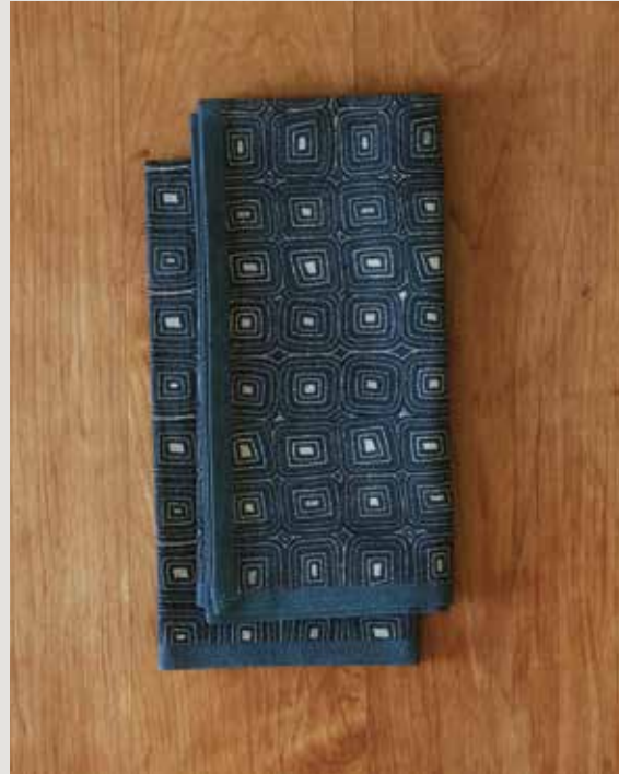
KAI NAPKIN 100% COTTON, 20"SQ, SET/4 INDIGO (NP01-IND)