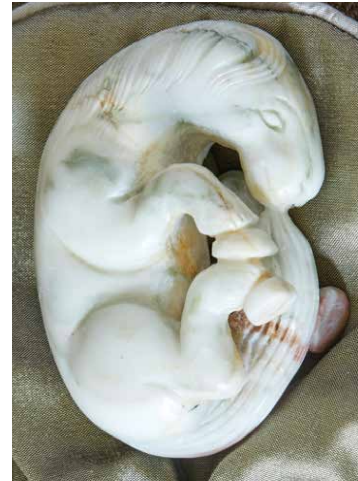
SHI "TRUTHFUL" OVAL HORSE MAP WEIGHT