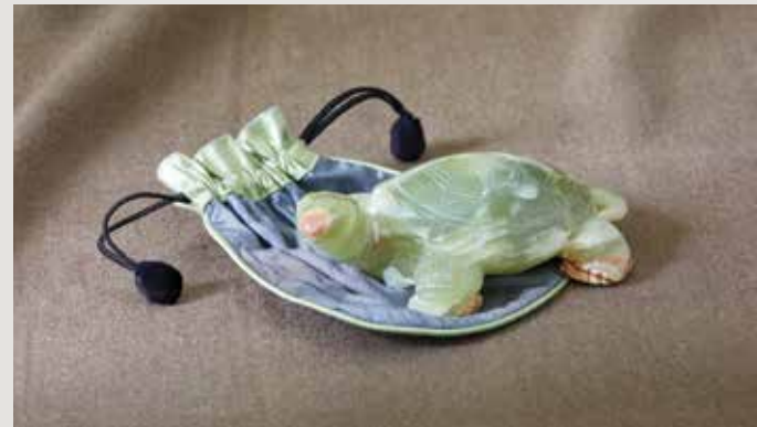
HAI "FROM THE SEA" TURTLE EMERALD GREEN ONYX, 5.5"L x 3.5"W x 1.75"H (SO07-ONX) — Presented in a unique silk pouch; colors may vary.