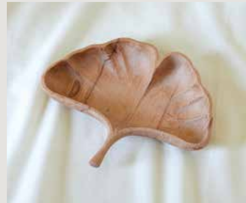
GINGKO BEECHWOOD, 9"L x 10.5"W x 1.75"H (WL02-BCH)