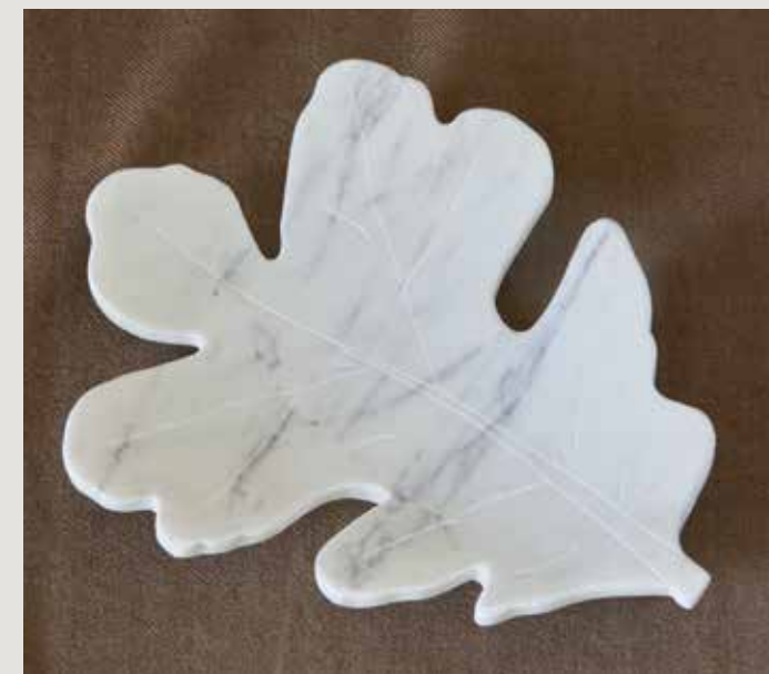
OAK WHITE MARBLE, 10.375"L x 8"W x 1.75"H (ML02-WHM)