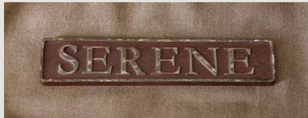
SERENE PAINTED CAST IRON, 9.75"L x 2"W x 0.5"H BORDEAUX (PW04-BOR)