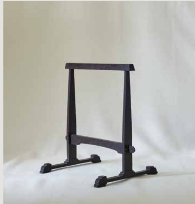
MEDIUM STAINED TEAK WOOD, 11"W x 8.875"D x 12"H ESPRESSO (EA02-ESP)