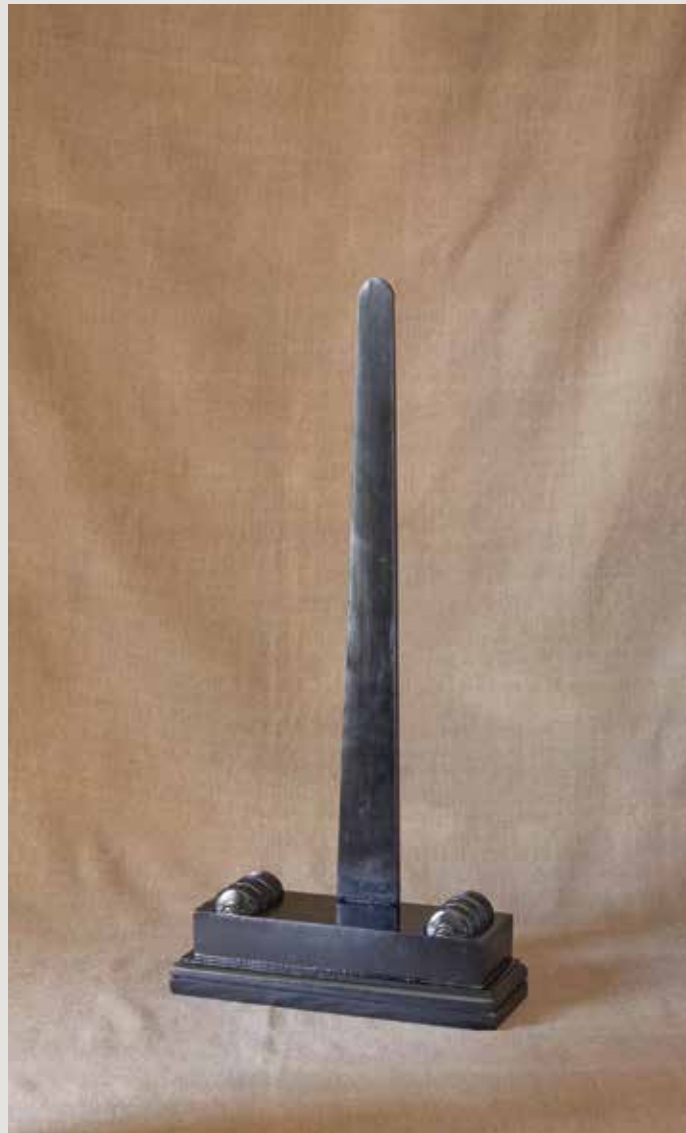
SMALL STAINED TEAK WOOD, 12"L x 4.375"D x 25"H EBONY (EA05-EBO)