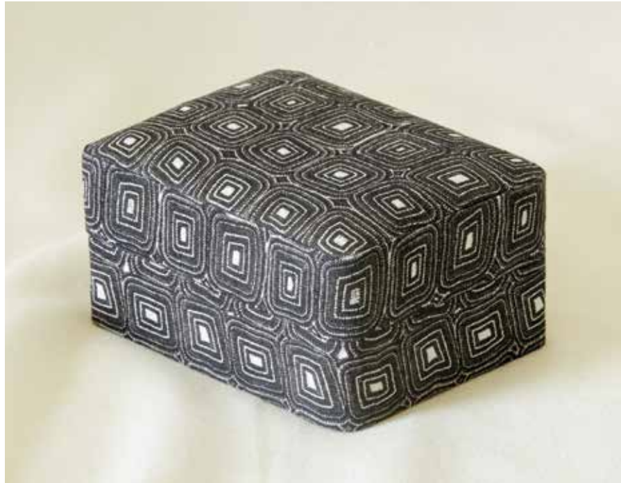
MEDIUM JUNIPER KAI DESK BOX