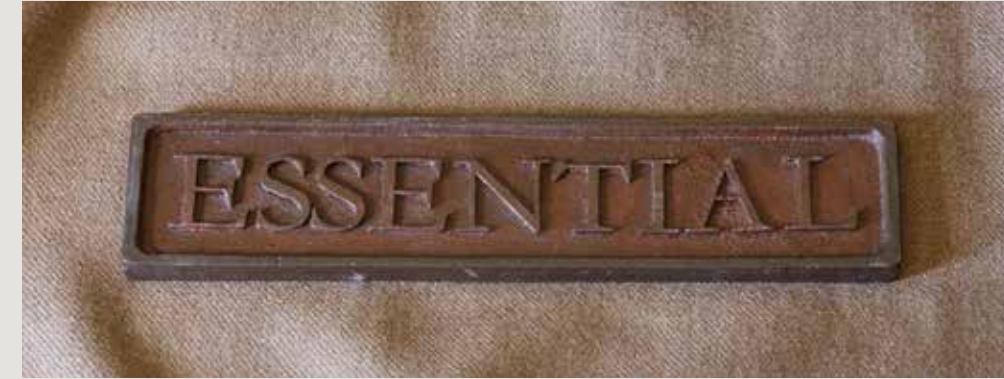
ESSENTIAL PAINTED CAST IRON, 9.75"L x 2"W x 0.5"H BORDEAUX (PW03-BOR)