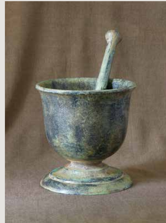
LE FER CAST IRON, MORTAR: 8"DIA x 8.25"H PESTLE: 2.25"DIA x 11.5"L (MP01-IRO)