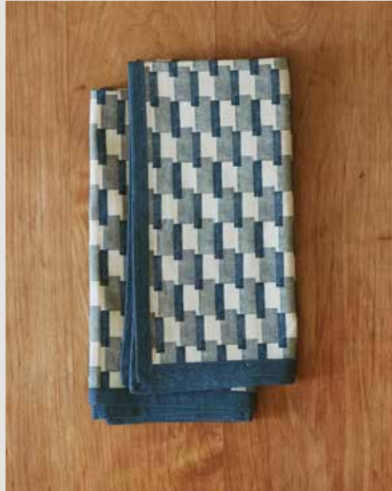
ISLA NAPKIN 100% COTTON, 20"SQ, SET/4 MARINE (NP02-MAR)