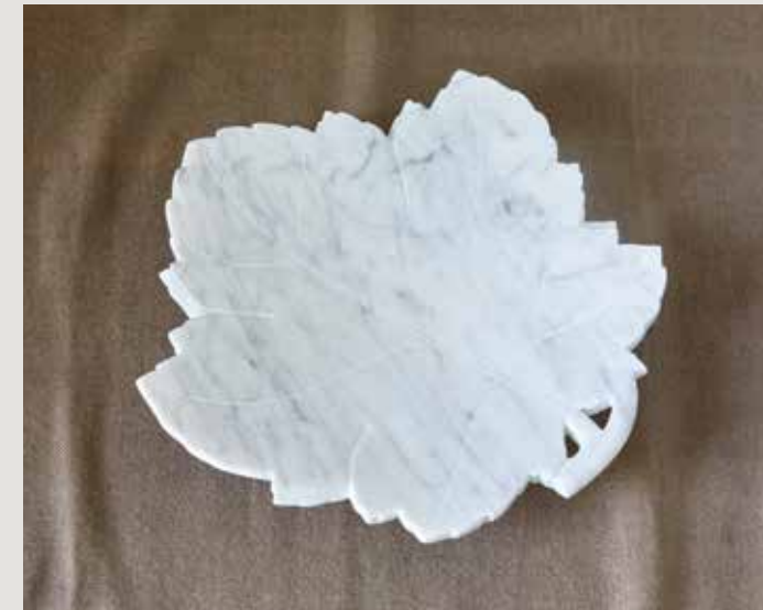
MAPLE WHITE MARBLE, 12"L x 11.5"W x 1.875"H (ML01-WHM)