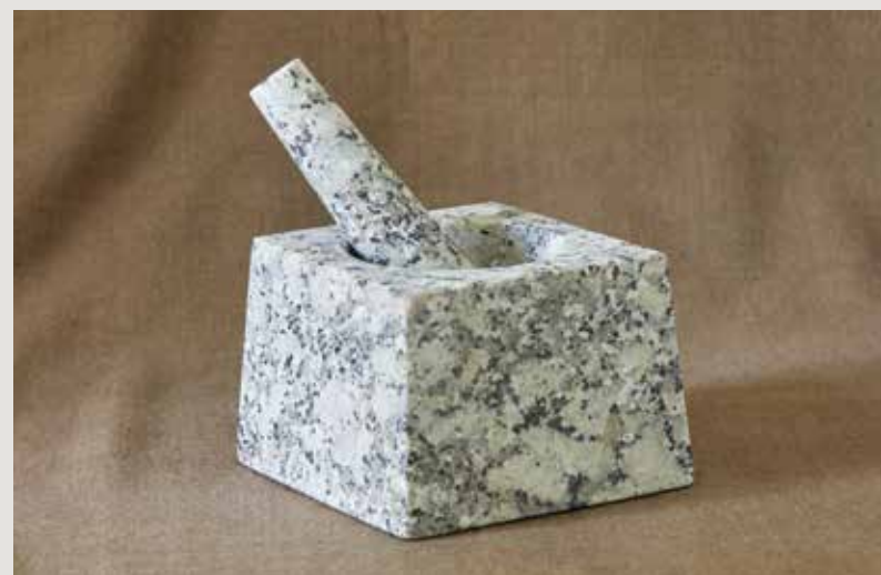
MODERN SQUARE GRANITE, MORTAR: 6"L x 6"D x 4"H / PESTLE: 1.75"DIA x 6.75"L (MP01-GRA)