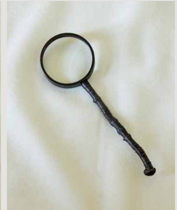
BRANCH ANTIQUÉ BRASS & GLASS, 2.5"DIA x 8.25"L x 1.125"H (MG02-BRS)