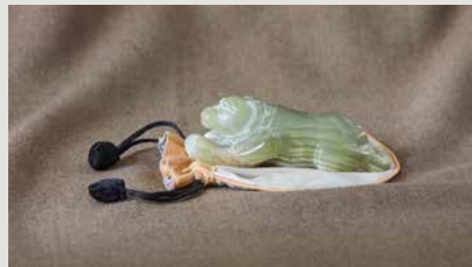
BAO "TREASURE" PANDA EMERALD GREEN ONYX, 4.5"L x 1.75"W x 1.25"H (SO01-ONX) — Presented in a unique silk pouch; colors may vary.