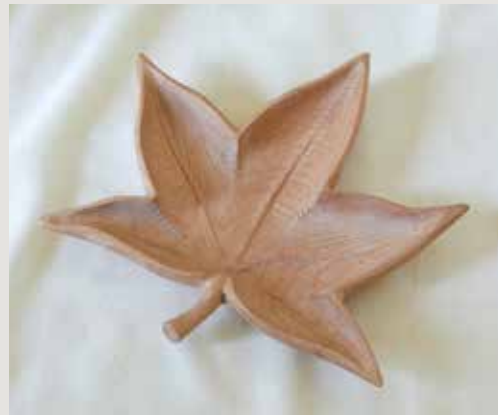
SUGAR GUM BEECHWOOD, 10.875"L x 10.875"W x 1.625"H (WL03-BCH)