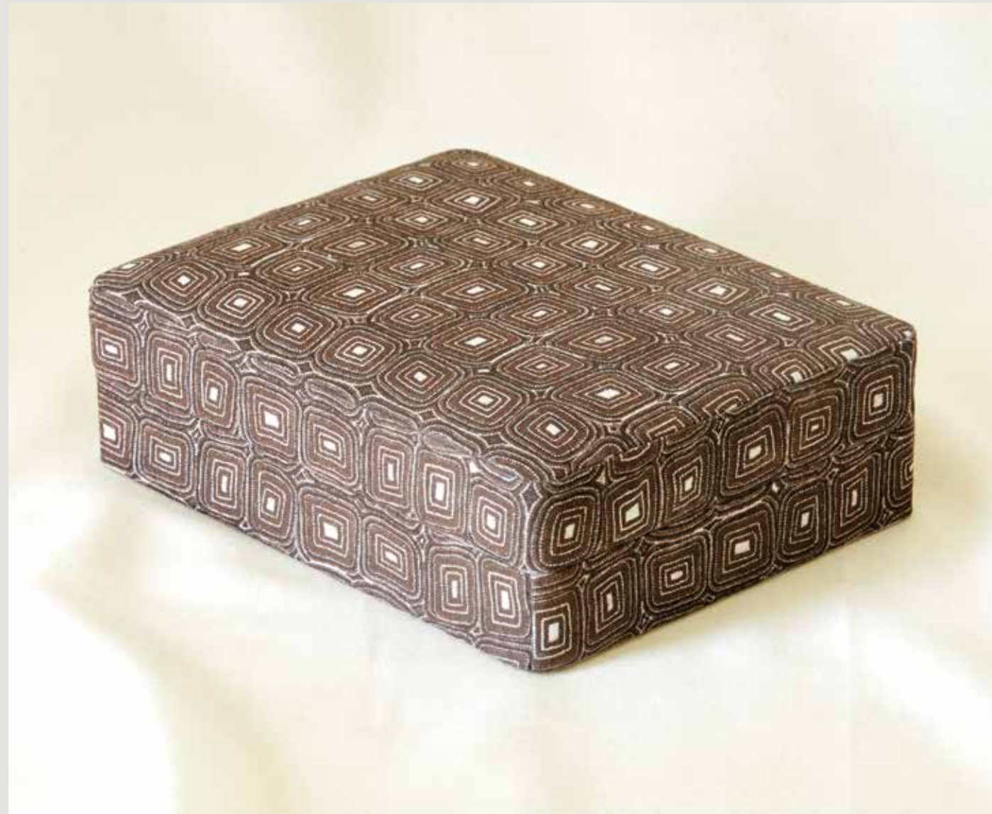
KAI DRESSER BOX 100% LINEN EXTERIOR / 100% COTTON LINING, 10"L x 7"D x 3.25"H CORDOVAN (BXK01-COR)