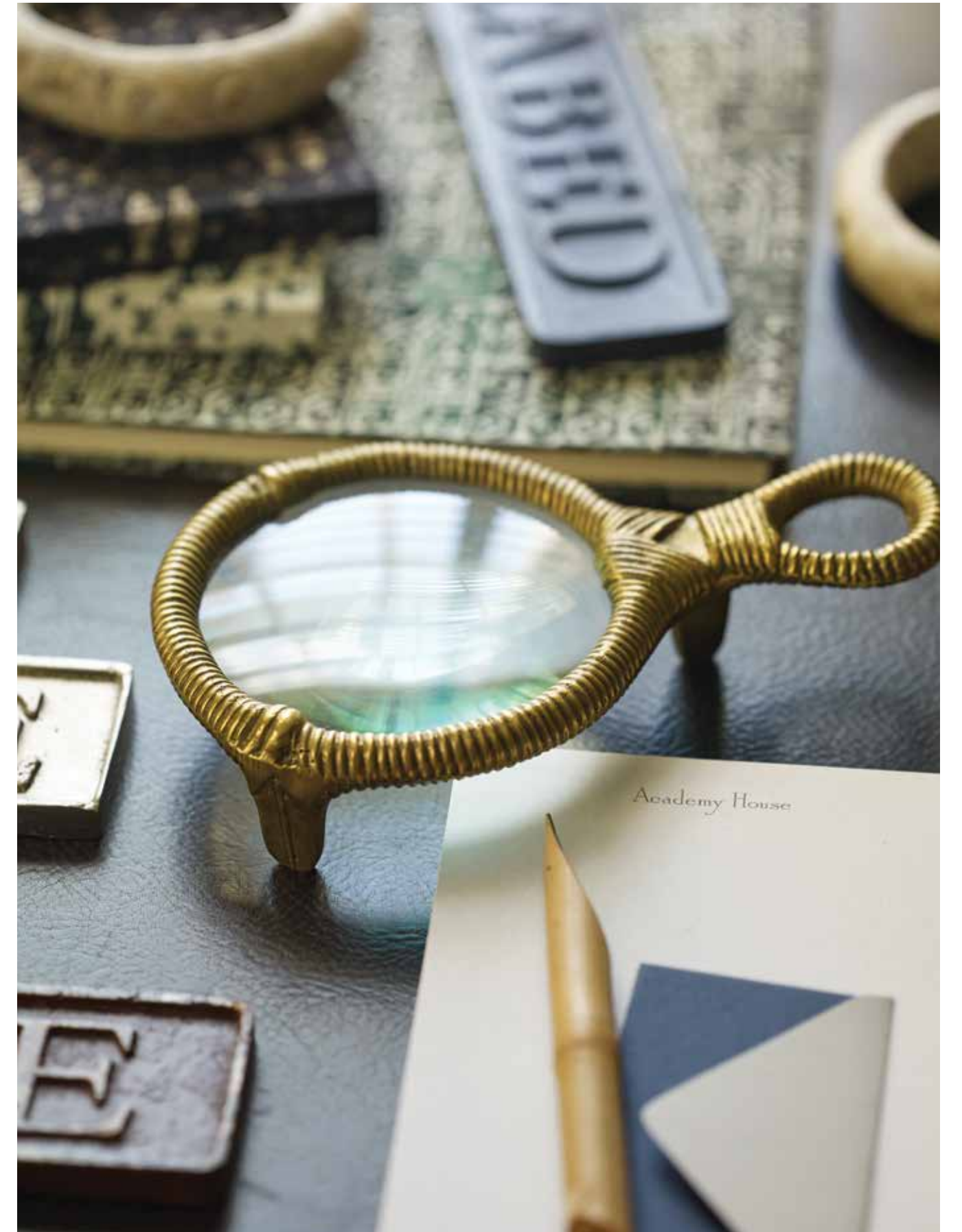
Gathered on the stitched leather-top desk of the Academy upstairs sitting room—favorite mixed elements with unique journals and paperweights from the desktop collection.

This standing magnifying glass is an interpretation of another vintage desktop glass. I love the rope-like detail and naturalistic form of the casting. It is like a magnified picture frame on a desk, so nice to view through, yet it's also a paperweight in its own way.