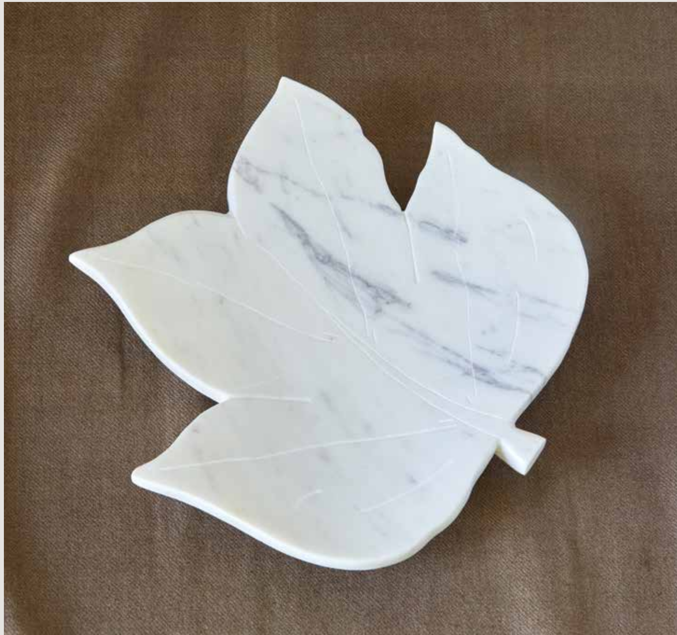
TULIP WHITE MARBLE, 10.75"L x 11.125"W x 1.75"H (ML03-WHM)