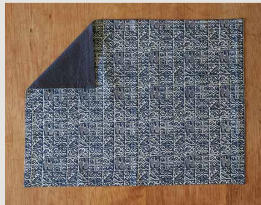
OCEANE PLACEMAT 100% COTTON, 19"L x 14"W, SET/4 INDIGO (PM02-IND)