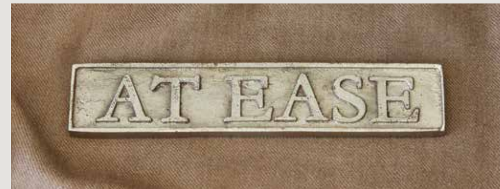
AT EASE NICKEL-PLATED CAST IRON, 9.75"L x 2"W x 0.5"H (PW02-NKL)