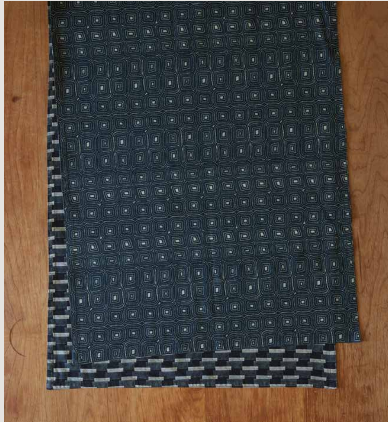
KAI/ISLA RUNNER 100% COTTON, 59"L x 20"W INDIGO (TR01-IND)