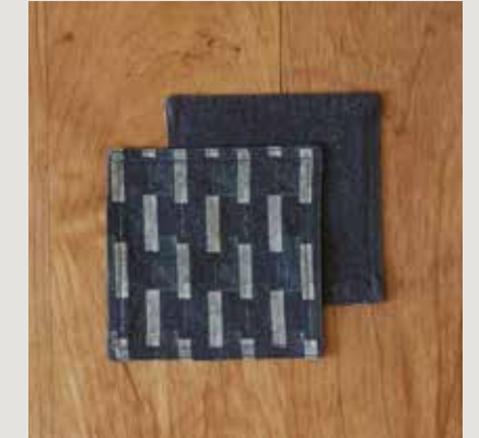
ISLA COASTERS 100% COTTON, 4"SQ, SET/4 INDIGO (CO02-IND)