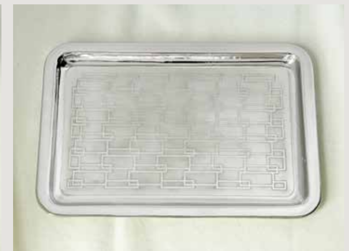
ISLA LARGE NICKEL-PLATED BRASS, 11"L x 7.75"W x 0.375"H (TY01-ISL)