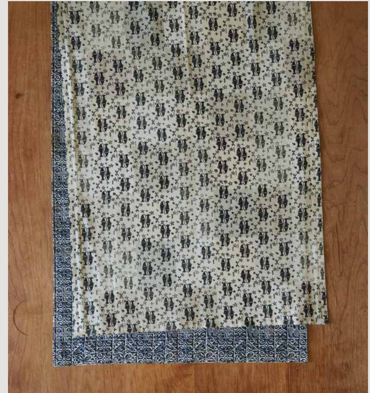
CASPIAN/OCEANE RUNNER 100% COTTON, 59"L x 20"W INDIGO (TR02-IND)