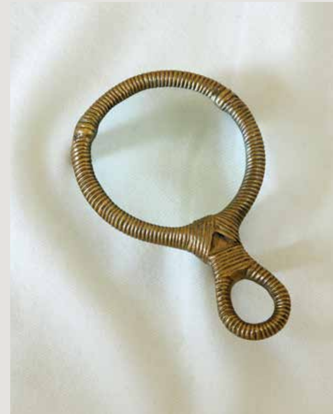
ENROULER ANTIQUÉ BRASS & GLASS, 4.25"DIA x 7.25"L x 1.5"H (MG01-BRS)