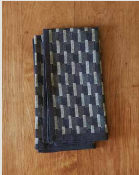
ISLA NAPKIN 100% COTTON, 20"SQ, SET/4 INDIGO (NP02-IND)