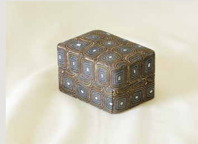
KAI SMALL DESK BOX 100% LINEN EXTERIOR / 100% COTTON LINING, 5"L x 3.125"D x 2.875"H EARTH (BXK05-EAR)