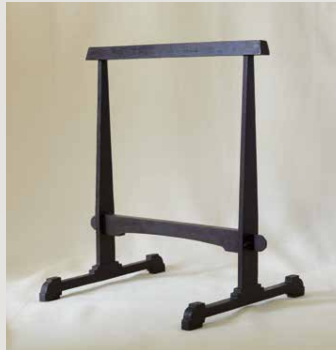
LARGE STAINED TEAK WOOD, 14.5"W x 11.875"D x 16"H ESPRESSO (EA01-ESP)