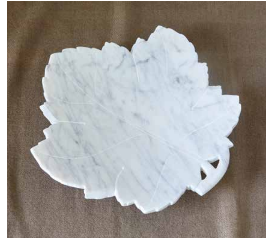
MAPLE LEAF MARBLE PLATE