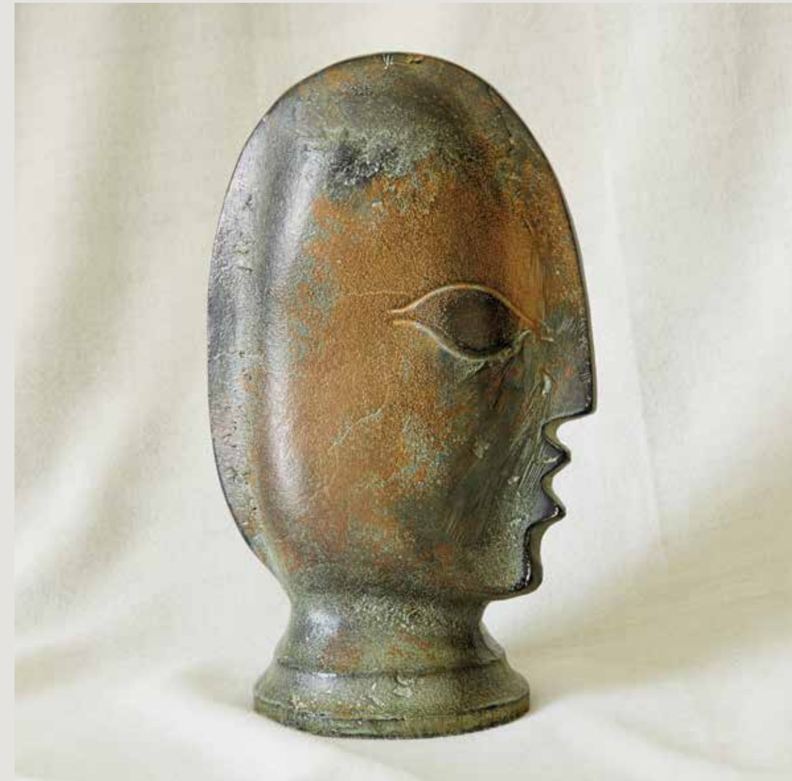
MODERN PORTRAIT HEAD BRASS-PLATED ALUMINUM, 6.75"L x 4.75"W x 11.5"H (SO08-BRS)