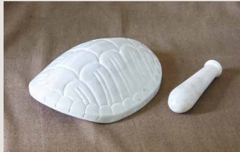
AZTEC TURTLE SHELL MARBLE, MORTAR: 9.625"L x 7.625"D x 3.875"H / PESTLE: 1.75"DIA x 6.75"L (MP01-MAR)