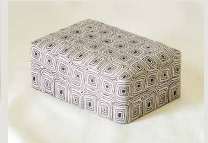
KAI JEWELRY BOX 100% LINEN EXTERIOR / 100% COTTON LINING, 8"L x 5"D x 2.5"H SAND (BXK02-SAN)