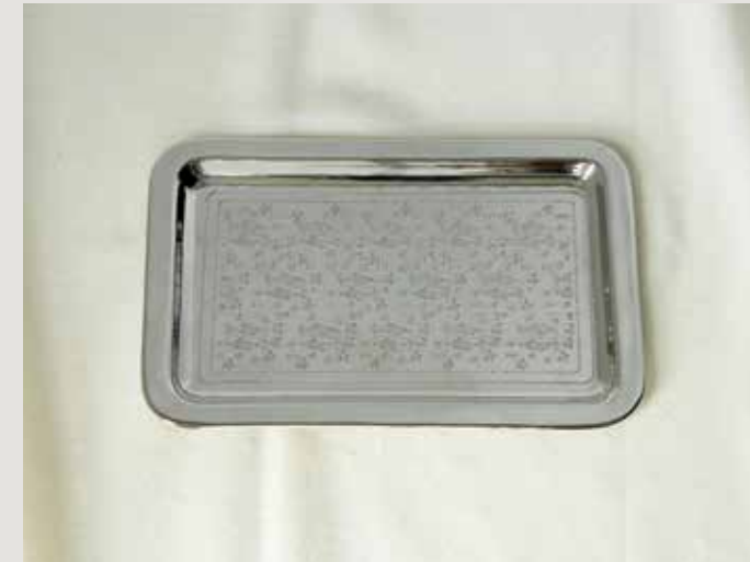
CASPIAN SMALL NICKEL-PLATED BRASS, 9.5"L x 6.375"W x 0.375"H (TY02-CAS)