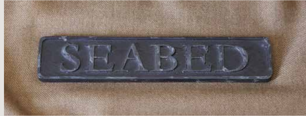
SEABED PAINTED CAST IRON, 9.75"L x 2"W x 0.5"H INDIGO (PW06-IND)