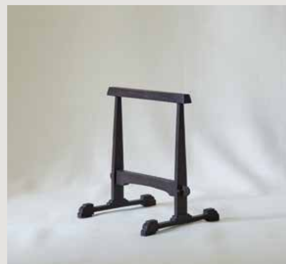
SMALL STAINED TEAK WOOD, 7.25"W x 6.25"D x 7.875"H ESPRESSO (EA03-ESP)