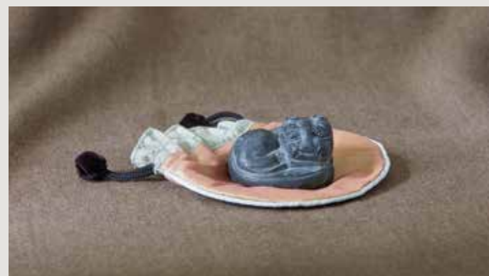
YING "CLEVER" DRAGON GREY-BLUE STONE, 2"L x 2"W x 1.5"H (SO02-STO) — Presented in a unique silk pouch; colors may vary.