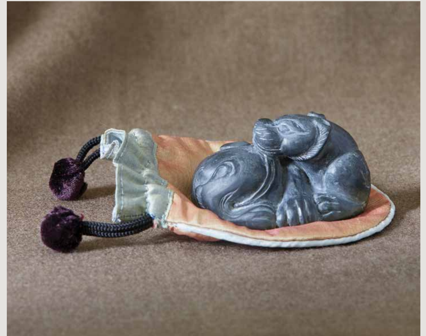
MING "ENLIGHTENING" LION GREY-BLUE STONE, 3"L x 2"W x 1.75"H (SO03-STO) — Presented in a unique silk pouch; colors may vary.