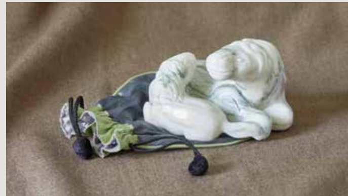
LAI TAI "VAST FUTURE" MOTHER AND CHILD HORSES MARBLE, 4.75"L x 3.75"W x 2.5"H (SO05-MAR) — Presented in a unique silk pouch; colors may vary.