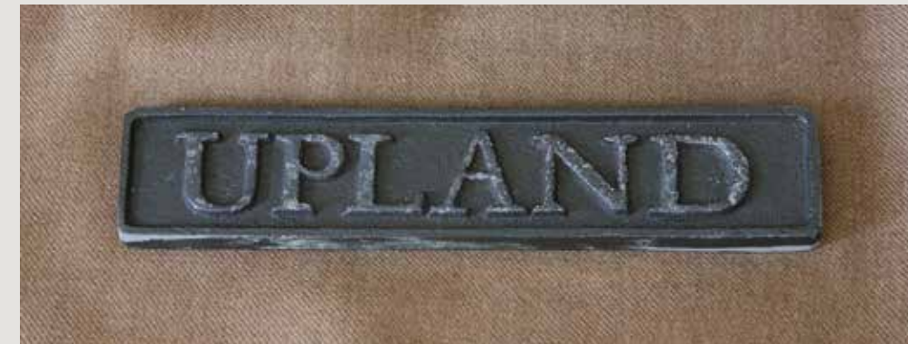
UPLAND PAINTED CAST IRON, 9.75"L x 2"W x 0.5"H JUNIPER (PW05-JUN)