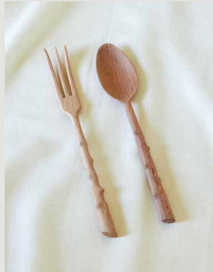
SERVERS BEECHWOOD, FORK: 11"L x 1"W x 0.875"H SPOON: 9.625"L x 0.625"W x 0.75"H (WS01-BCH)