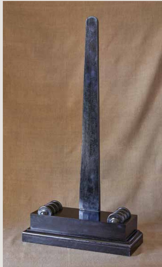
LARGE STAINED TEAK WOOD, 16.25"L x 7.75"D x 32"H EBONY (EA04-EBO)