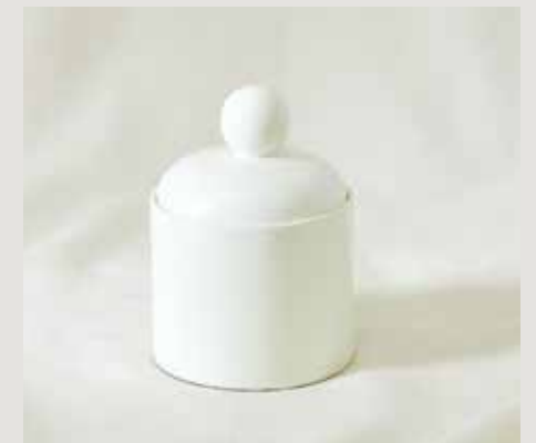
DRESSER CANISTER LARGE LACQUERED WOOD, 4.375"DIA x 6.125"H From Left: BLEU MARIN (MB02-BLE), BORDEAUX (MB02-BOR), IVOIRE (MB02-IVO)