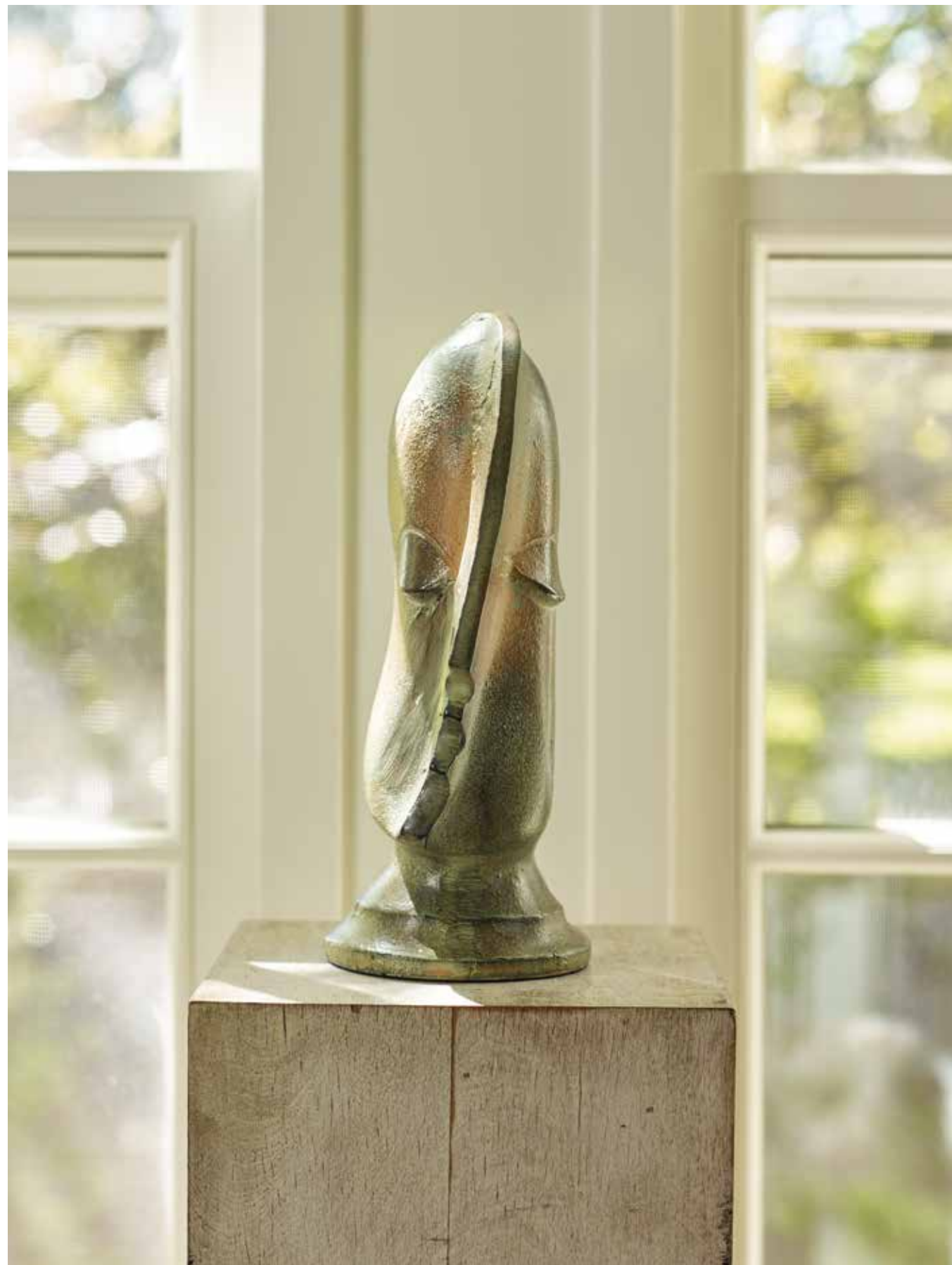
Collections are made up of things found and things given. What makes this sculpture so special to me is that it was a gift from my husband, Dan. We have it on a sunlit library table among other books and treasures.