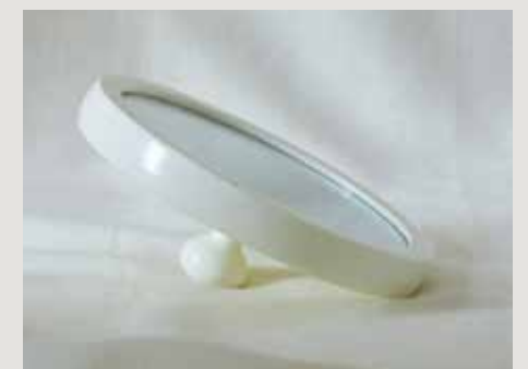
DRESSER MIRROR LACQUERED WOOD, 6.75"DIA x 2.75"H From Left: BLEU MARIN (MB03-BLE), BORDEAUX (MB03-BOR), IVOIRE (MB03-IVO)