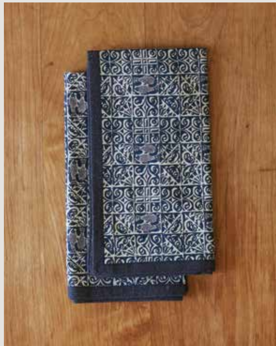
OCEANE NAPKIN 100% COTTON, 20"SQ, SET/4 INDIGO (NP03-IND)