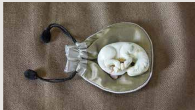
SHI "TRUTHFUL" OVAL HORSE MARBLE, 2.75"L x 2"W x 1"H (SO06-MAR) — Presented in a unique silk pouch; colors may vary.