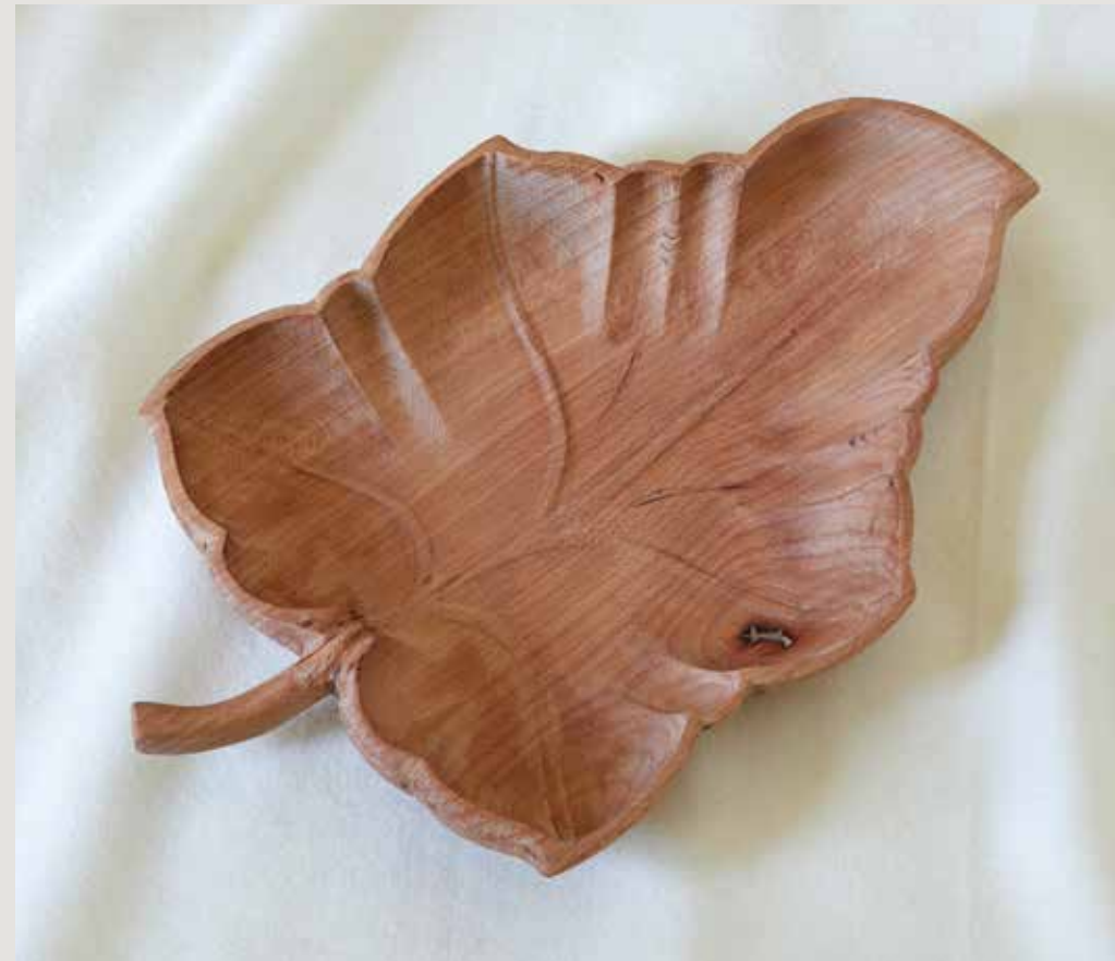
BOTANIQUE BEECHWOOD, 13.875"L x 8.375"W x 1.625"H (WL01-BCH)