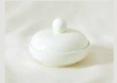
DRESSER CANISTER SMALL LACQUERED WOOD, 5.125"DIA x 3.75"H From Left: BLEU MARIN (MB01-BLE), BORDEAUX (MB01-BOR), IVOIRE (MB01-IVO)