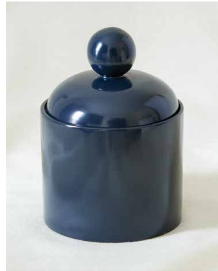
LARGE BLEU MARIN DRESSER CANISTER