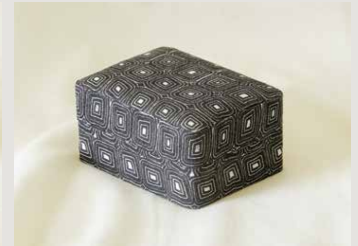
KAI MEDIUM DESK BOX 100% LINEN EXTERIOR / 100% COTTON LINING, 6"L x 4.125"D x 3.625"H JUNIPER (BXK04-JUN)