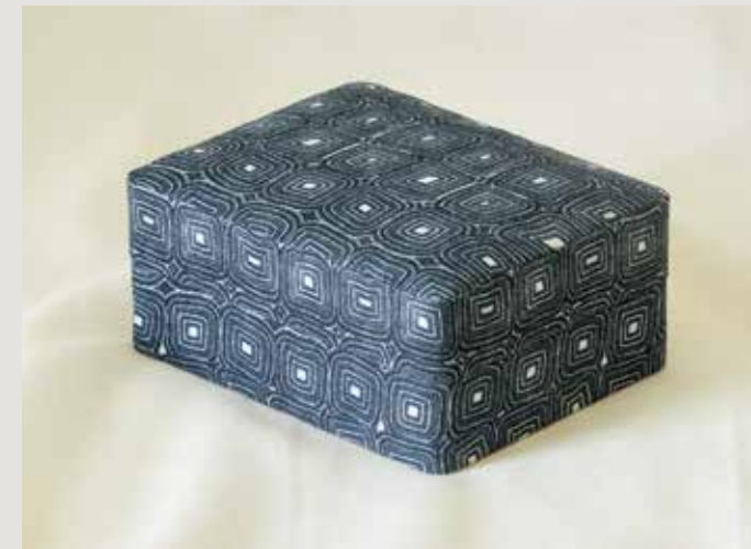
KAI LARGE DESK BOX 100% LINEN EXTERIOR / 100% COTTON LINING, 7"L x 5.125"D x 4.25"H INDIGO (BXK03-IND)