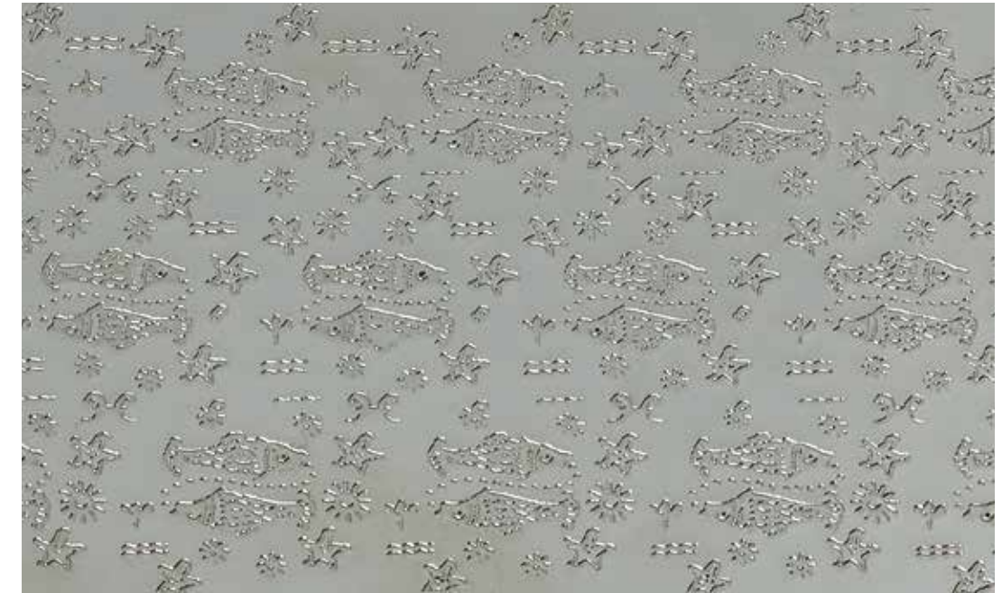
CASPIAN SMALL PLATED TRAY DETAIL

For summer meals on the screen porch, we set the table with combinations of dishes and linens, antique and modern together. That easy, casual mix is the feeling we love in this house by the sea.