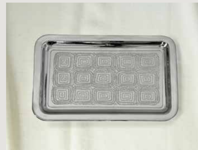
KAI SMALL NICKEL-PLATED BRASS, 9.5"L x 6.375"W x 0.375"H (TY02-KAI)